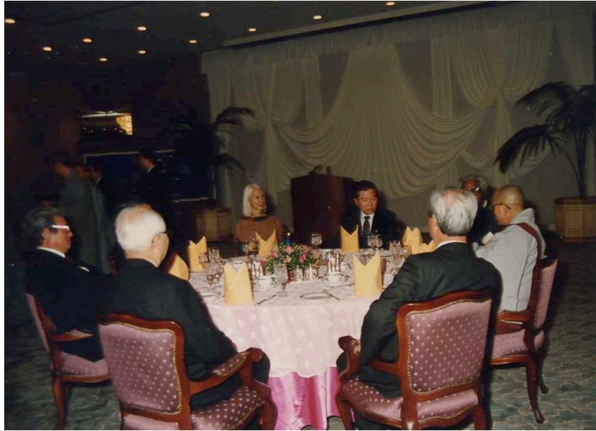
Photo 3: A dinner photo taken at the Sheraton Walker Hill with former South Korean President Gim Daejung and the seminar representatives. President Gim Daejung delivered a special speech to the seminar participants