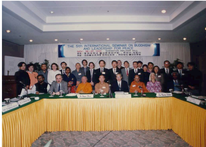
Photo 1: Group picture of contributors taken at the Sheraton Walker Hill.